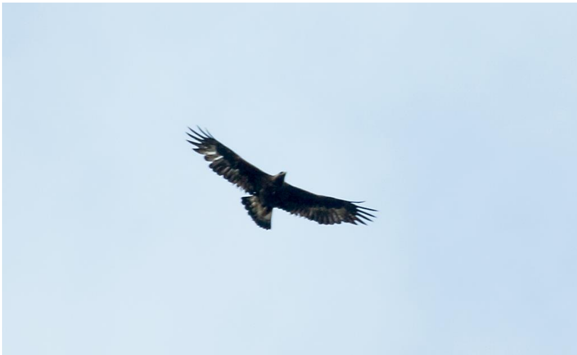
Golden Eagle by Carl Chapman

We will also be dropping off en route back to Norfolk.