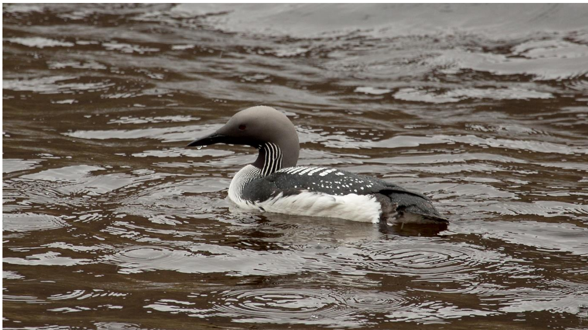
Black throated Diver

A single room supplement of £75 is payable although sharing can be arranged on most occasions.