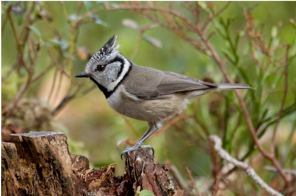
Crested Tit by Carl Chapman

We will have an early morning visit for Capercaillie. There may also be the added benefit of Crested Tit in the surrounding woodlands. Later in the day a visit to the higher Mountain Plateau on Cairngorm may well give us the opportunity to see first of all Black Grouse followed by Red Grouse and Snow Bunting and as we press upward the enigmatic Ptarmigan.