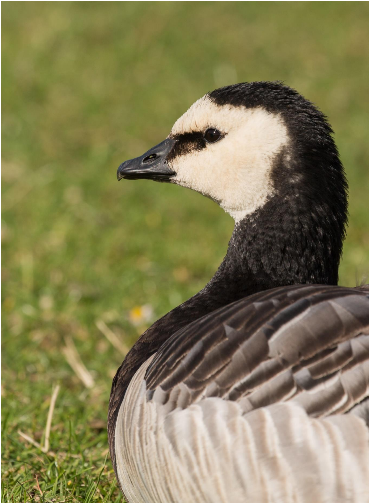
We can see Barnacle Geese in spectacular numbers on this tour