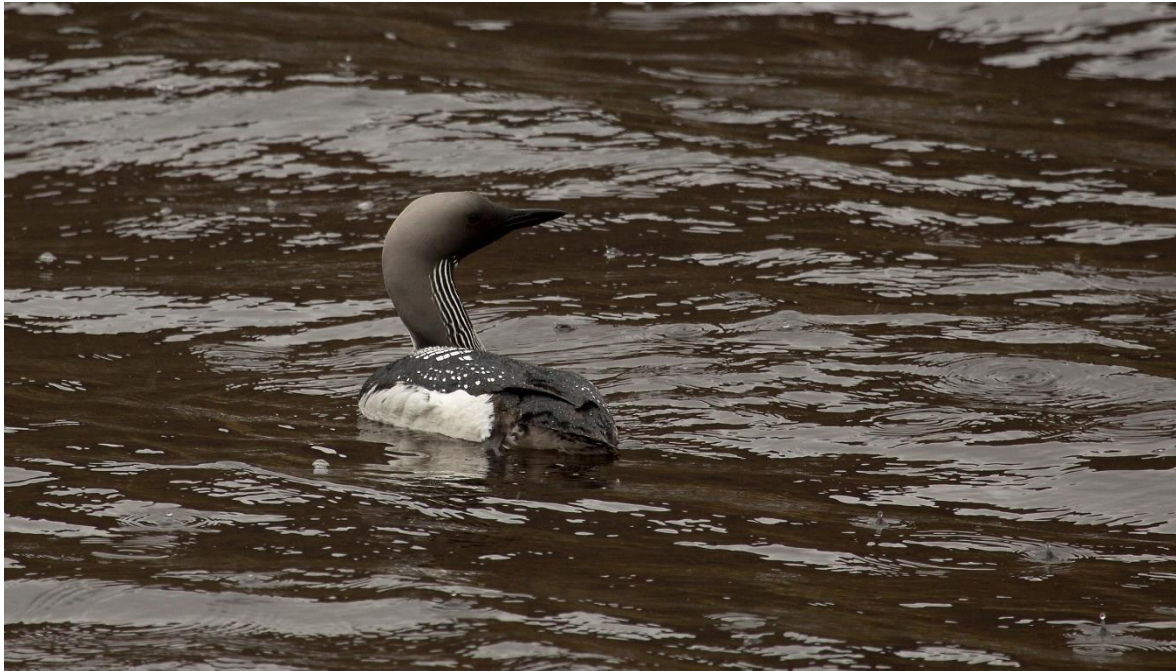
Black throated Diver by Carl Chapman

A single room supplement of £85 is payable although sharing can be arranged on most occasions.