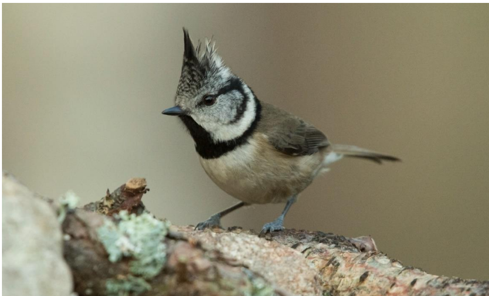
Crested Tit

We will have an early morning visit for Capercaillie. There may also be the added benefit of Crested Tit in the surrounding woodlands. Later in the day a visit to the higher Mountain Plateau on Cairngorm may well give us the opportunity to see first of all Black Grouse followed by Red Grouse and Snow Bunting and as we press upward the enigmatic Ptarmigan. How close we get will depend on the weather and if the funicular is operating.