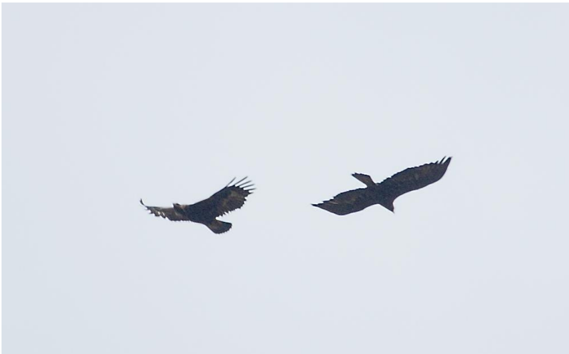
Golden Eagles by Carl Chapman

We will also be dropping off en route back to Norfolk.