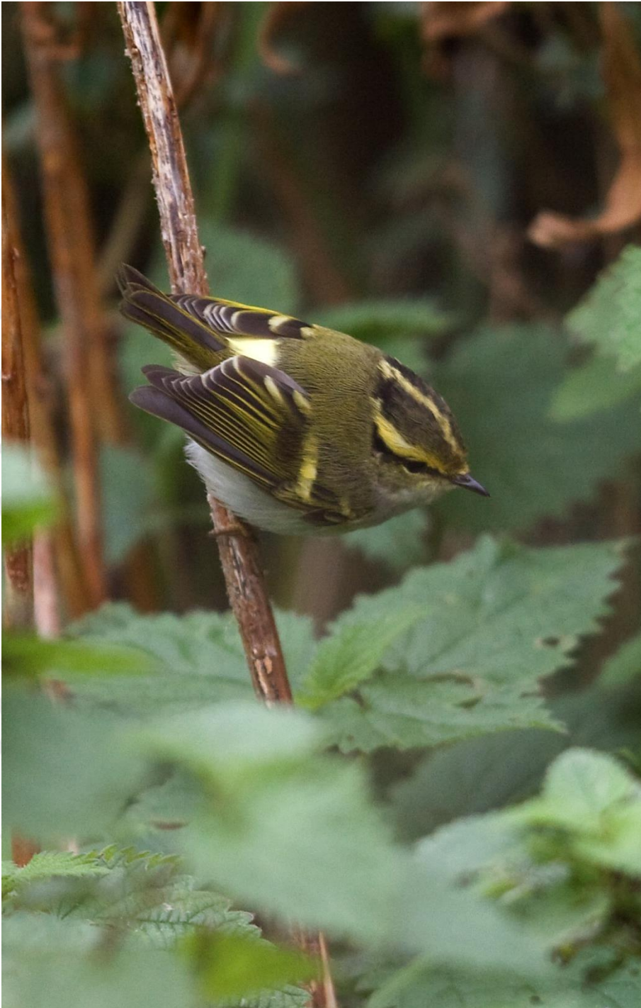
Pallas's Warbler taken in Norfolk