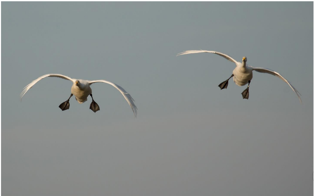
Wintering Whooper Swans are a feature of Caerlaverock but by no means the only highlight

After a filling breakfast we will make our way onto the local WWT reserve at Caerlaverock and surrounding areas. The centre of attraction will be the thousands of Barnacle geese that use the reserve during winter. Any small flocks of this goose elsewhere in the UK are usually escapes from collections or at best feral birds so the chance to study wild barnacles in their wintering quarters will be quite special. Other geese species will also be present and the chance of a rarity among them is high. The reserve is also used as a wintering area by raptors and owls; Peregrine and Goshawk are possible. Whooper Swans also return annually to the reserve and the area is used by wintering waders and duck including over wintering Scaup and Whimbrel. Green winged Teal and Goosander are also regular visitors during February. The area is a true delight and offers a great wildlife spectacle.