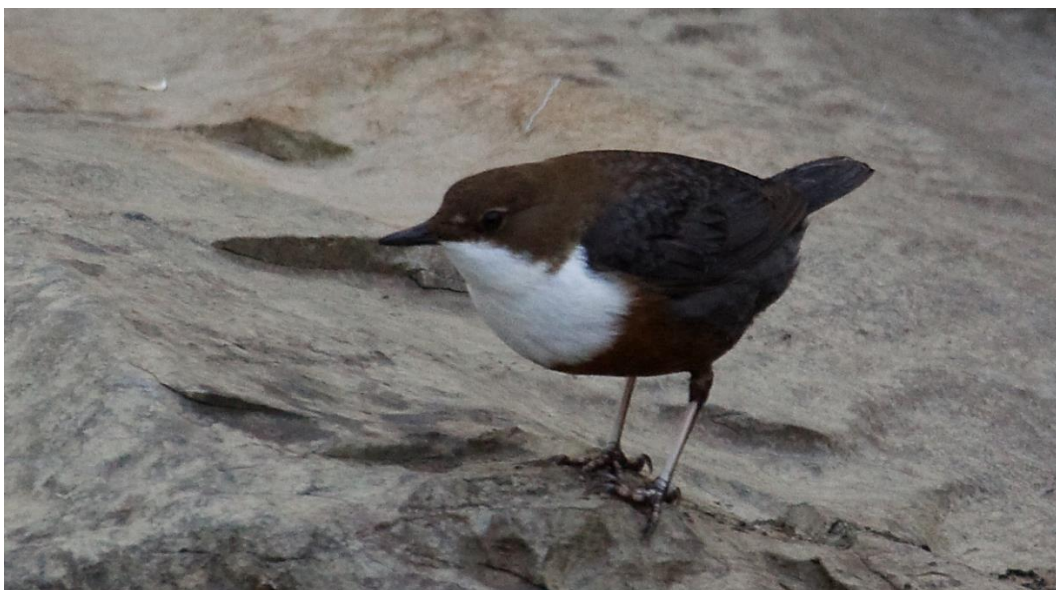
Dippers are not uncommon on the rivers of southern Scotland