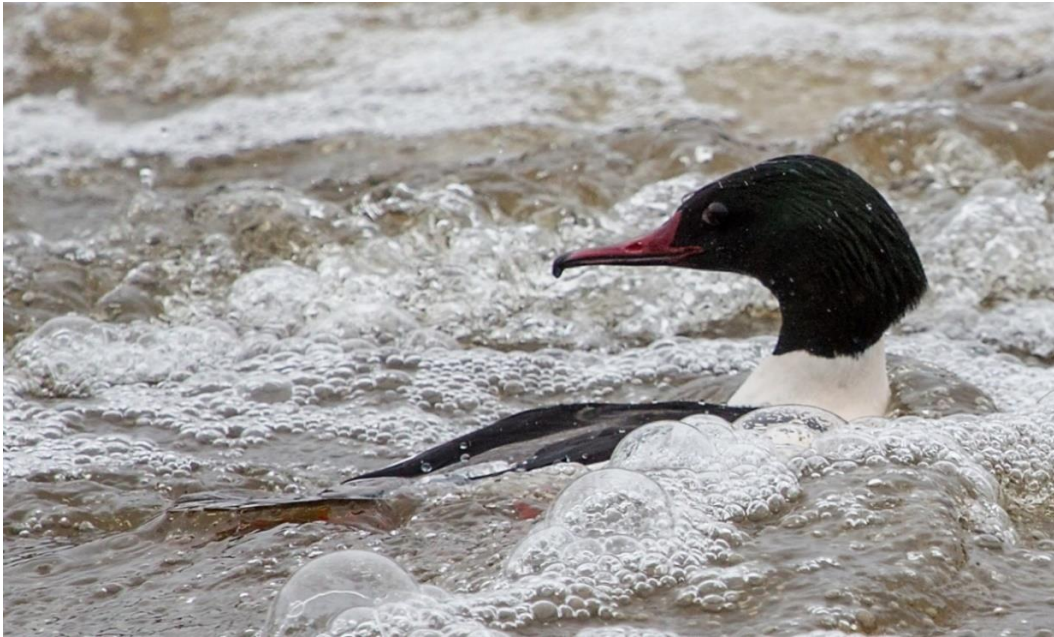
Goosander – spectacular swimmers in rough water and there will be ample opportunity to photograph them

After breakfast we will search a local river for Dipper, Goosander Grey Wagtails and perhaps Otter before making our way to RSPB Mereshead. Here we are likely to see more Barnacle Geese among more traditional farmland birds as well as winter visiting raptors.