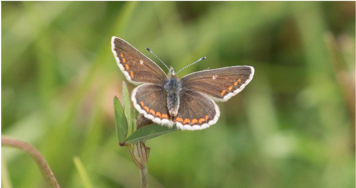
Northern Brown Argus by Carl Chapman

We will also be dropping off en route back to Norfolk.