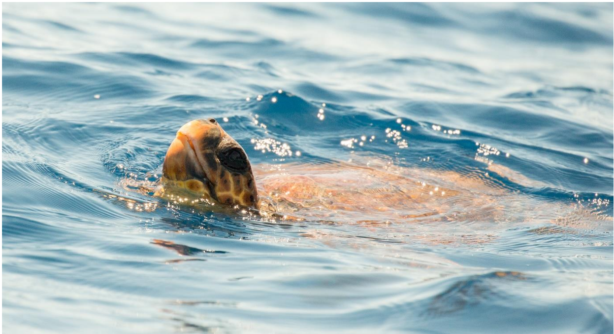
Loggerhead Turtle which stayed around the boat for some time

8 th June – A trip out with Wind birds from Machico. Very little to see except Spotted Dolphin. However we came across a Loggerhead Turtle close to the boat. After the boat trip a walk around Machico itself now the festival had finished was productive with good views of the Waxbills in the reedbeds within the channelled water course running through the town. Later a run up to Verdos Dos Balcoes at Riberio Frio was enjoyable.