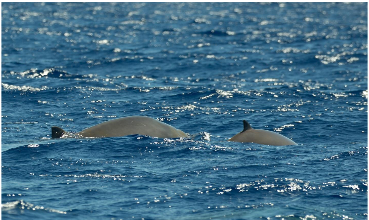
Blainville's Beaked Whales surprisingly close to land.

During our drive to the gardens we were stopped so the basket sledges could pass - this is a touristy thing where a sledge with people on board is guided down the steep side roads by two sledge drivers or carreiros wearing white uniforms and straw hats! - you have been warned!