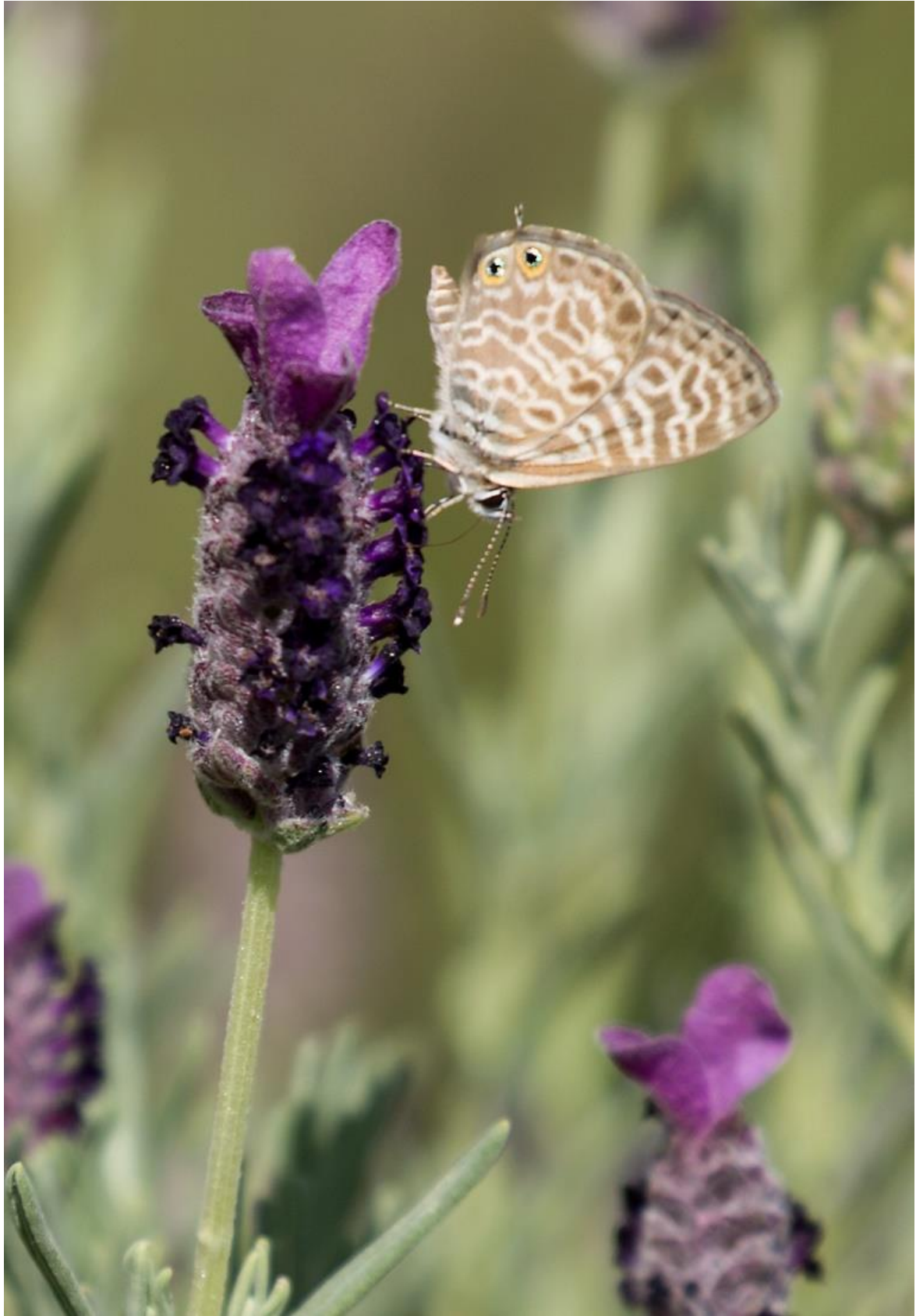
Lang's Short Tailed Blue Butterfly one of the specialities of the botanical gardens and quite difficult to find. Several were found at the western end of the gardens on Lavender.