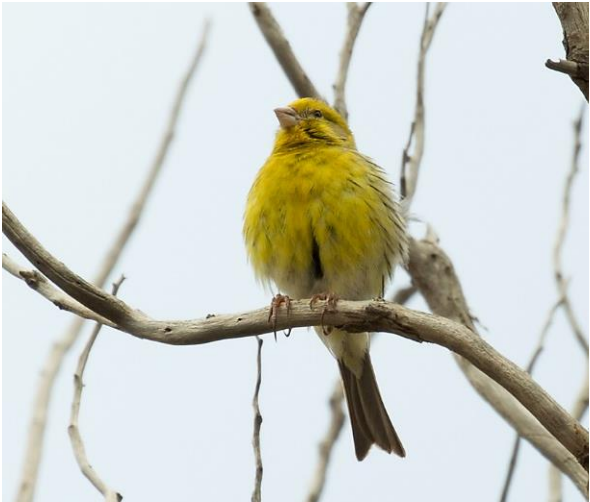
Canaries could be heard all over Machico