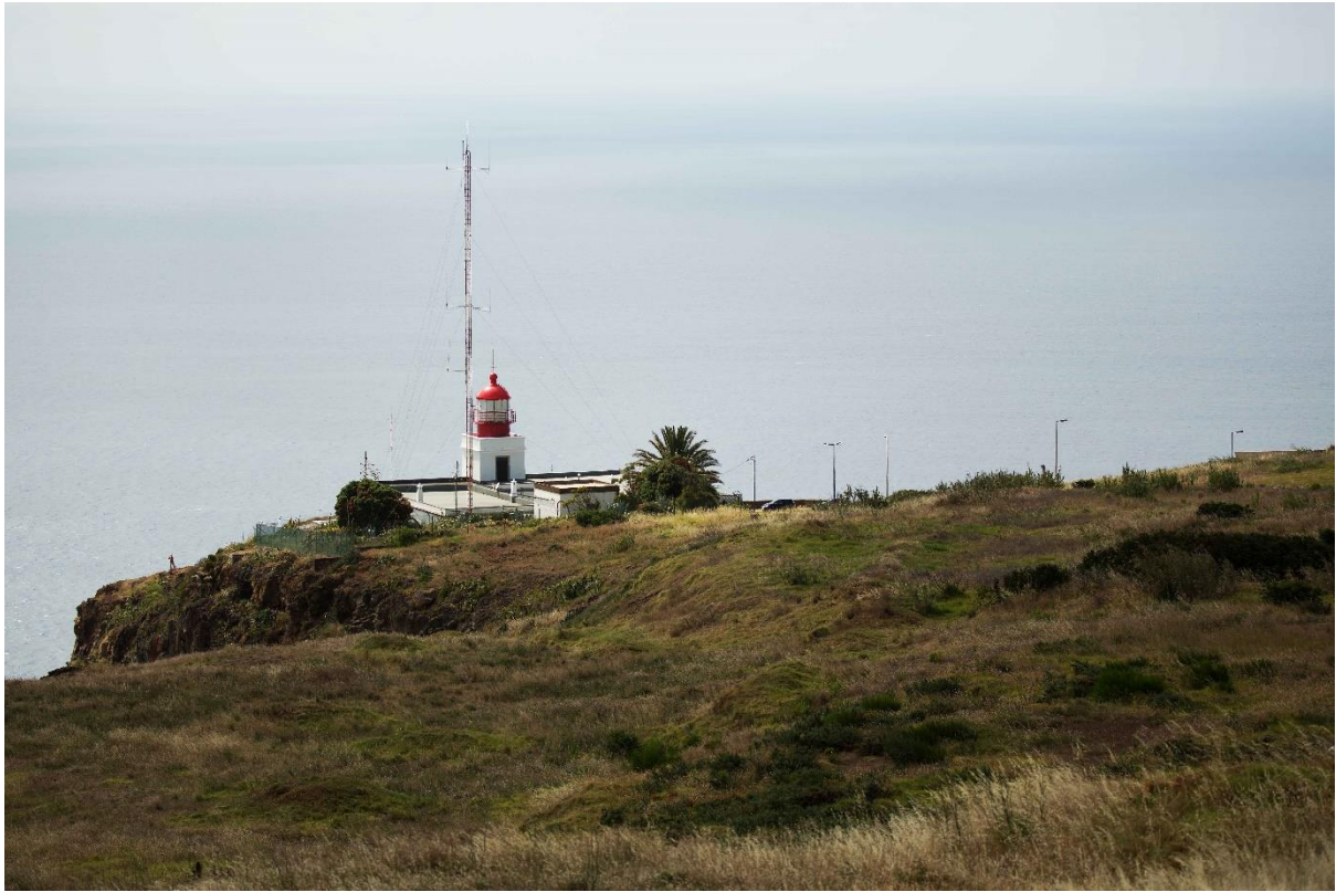
Lighthouse at Ponto do Fango on the west of the island

8 th June – A trip out with Wind birds from Machico. Very little to see except Spotted Dolphin. However we came across a Loggerhead Turtle close to the boat. After the boat trip a walk around Machico itself now the festival had finished was productive with good views of the Waxbills in the reedbeds within the channelled water course running through the town. Later a run up to Verdos Dos Balcoes at Riberio Frio was enjoyable.