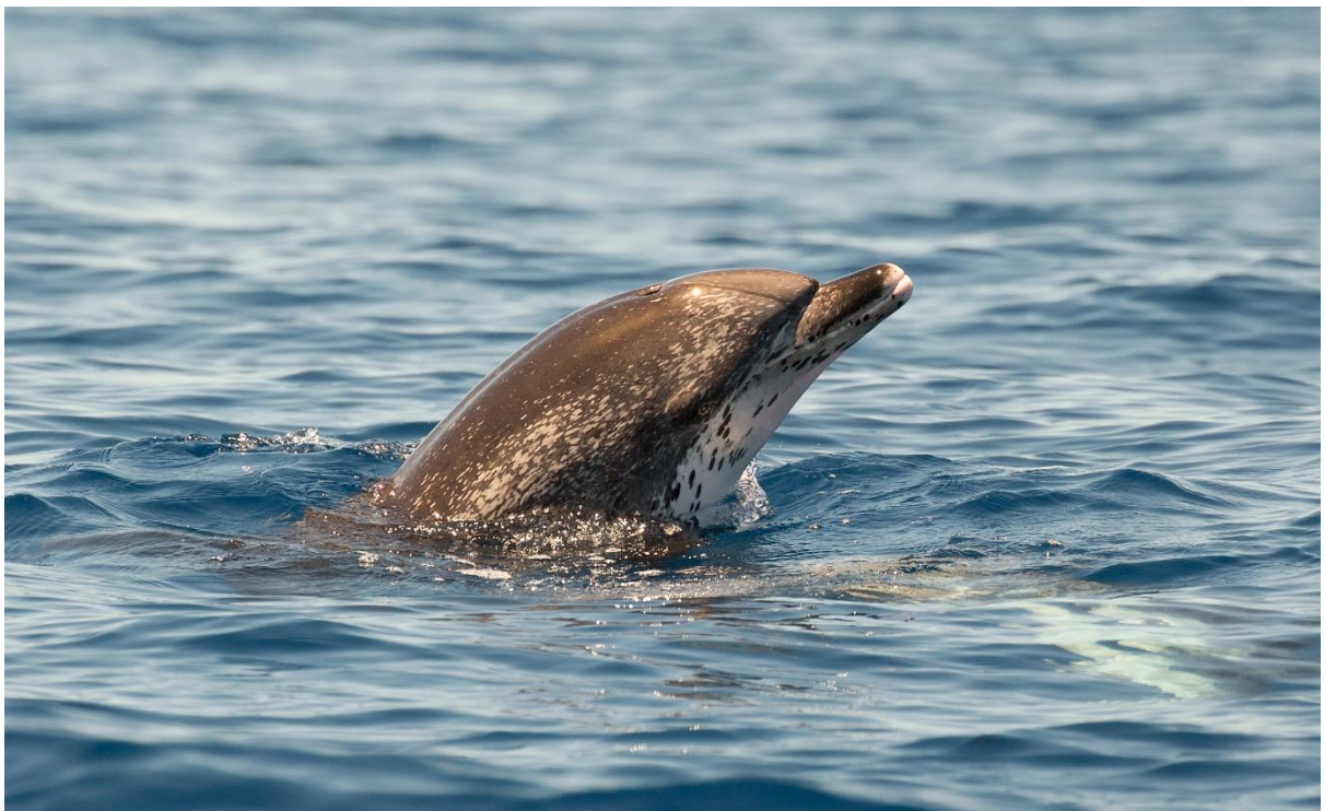
Adult Spotted Dolphin spy-hopping