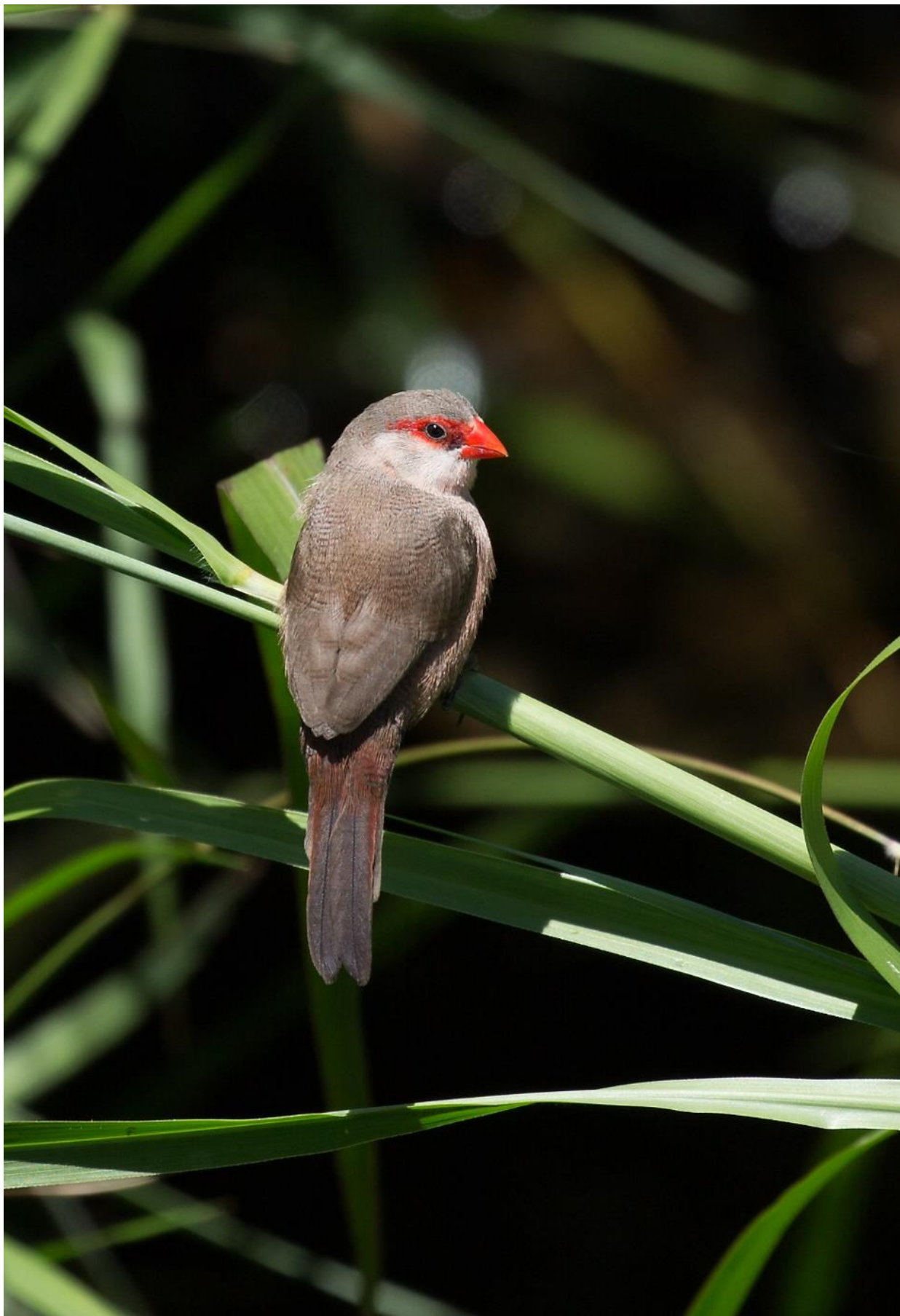
waxbills were in good numbers within the watercourse at Machico