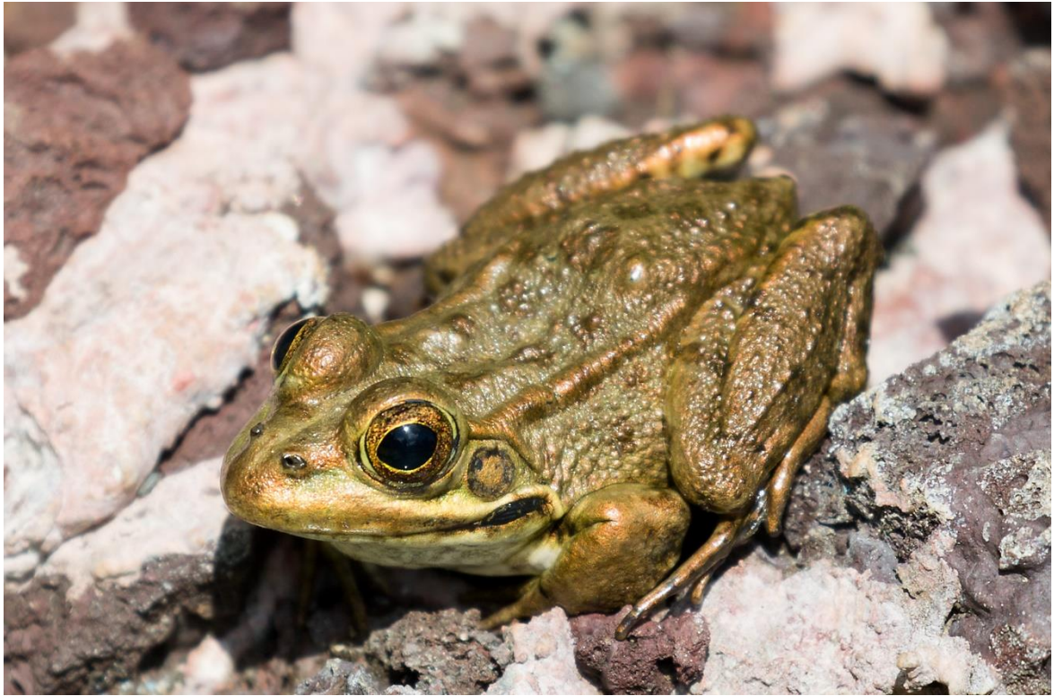
Perez's Frog – another speciality of the botanical gardens