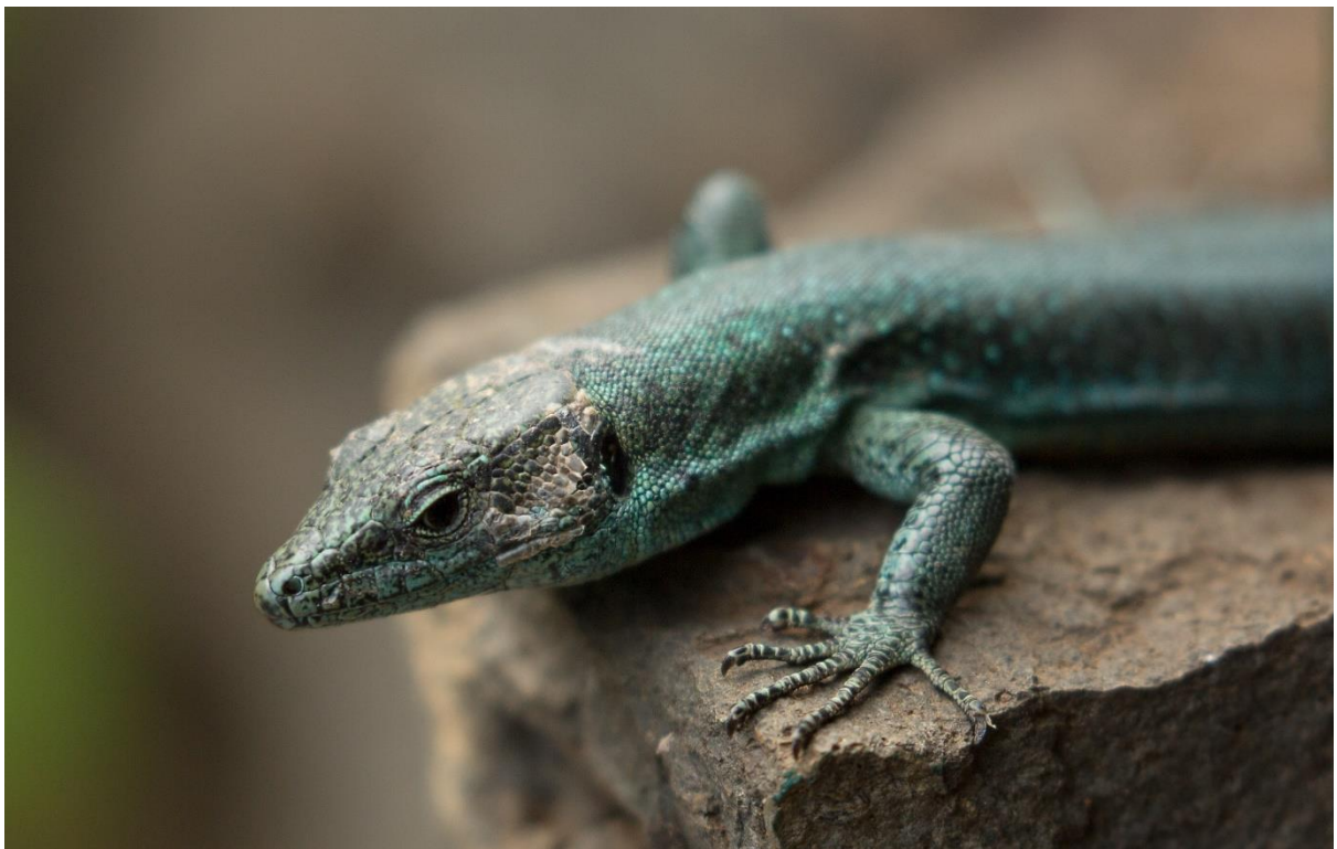
Madeiran Wall Lizards were plentiful, colourful and varied in the gardens