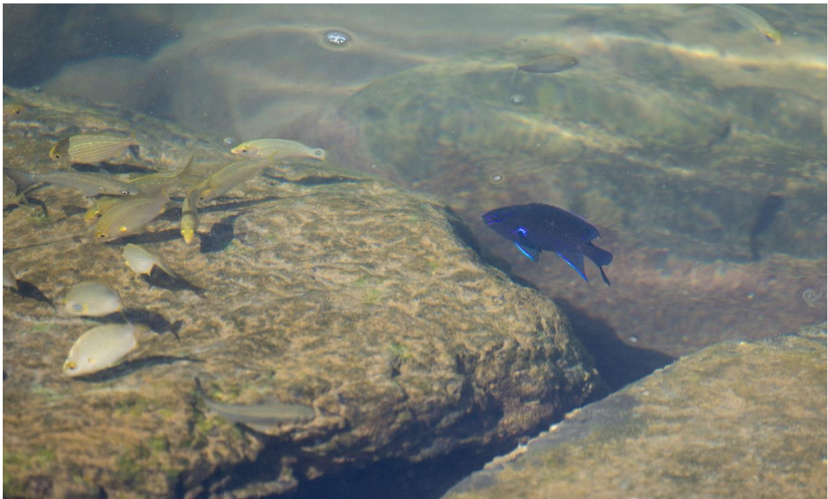
A Canary Damsel sporting its neon stripes