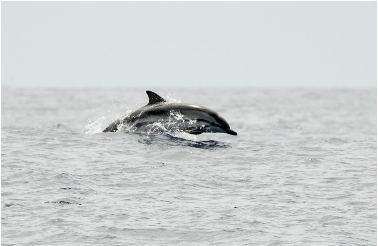
Striped Dolphin - a very wary species not easy to get close