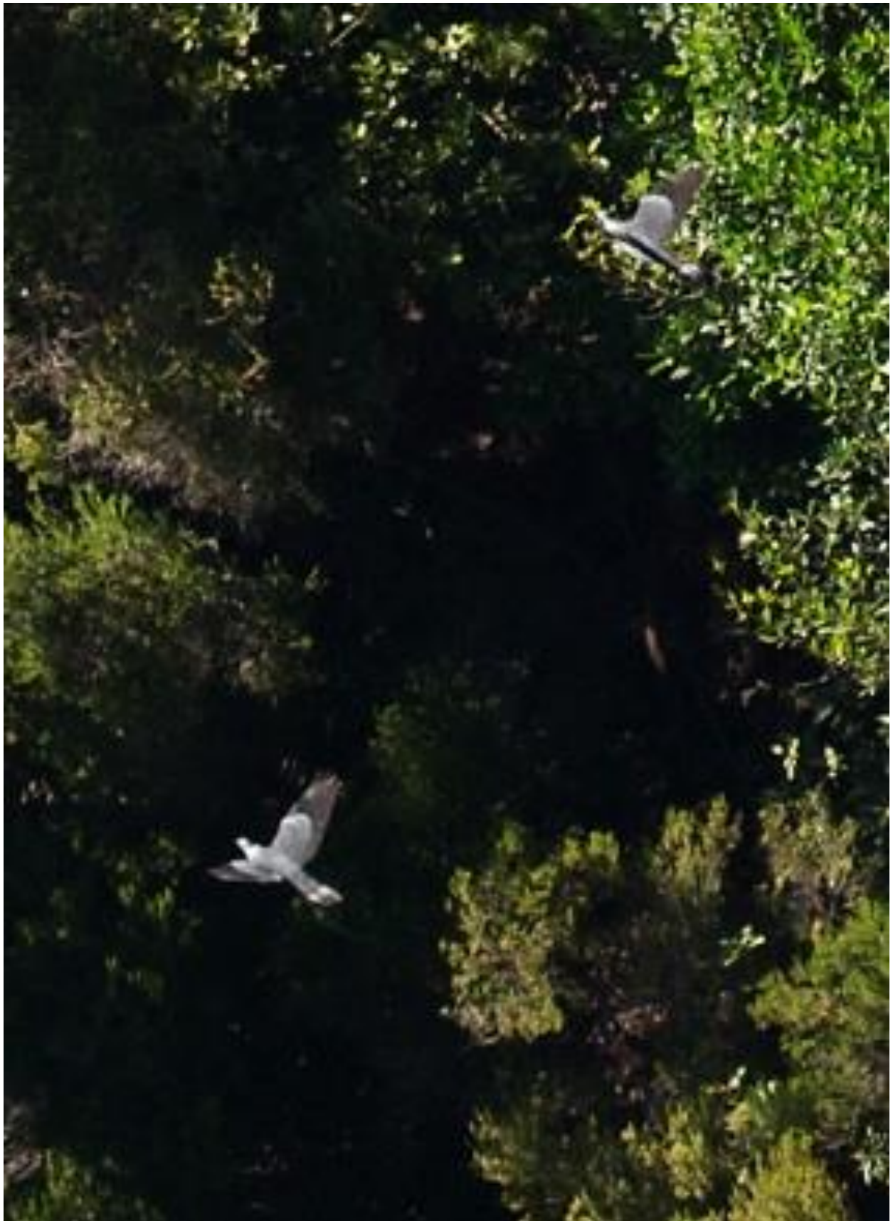
One of the rarest breeding birds in Europe the distinctive Trocaz Pigeon wasn't too difficult to find – photographing however, is a different matter.