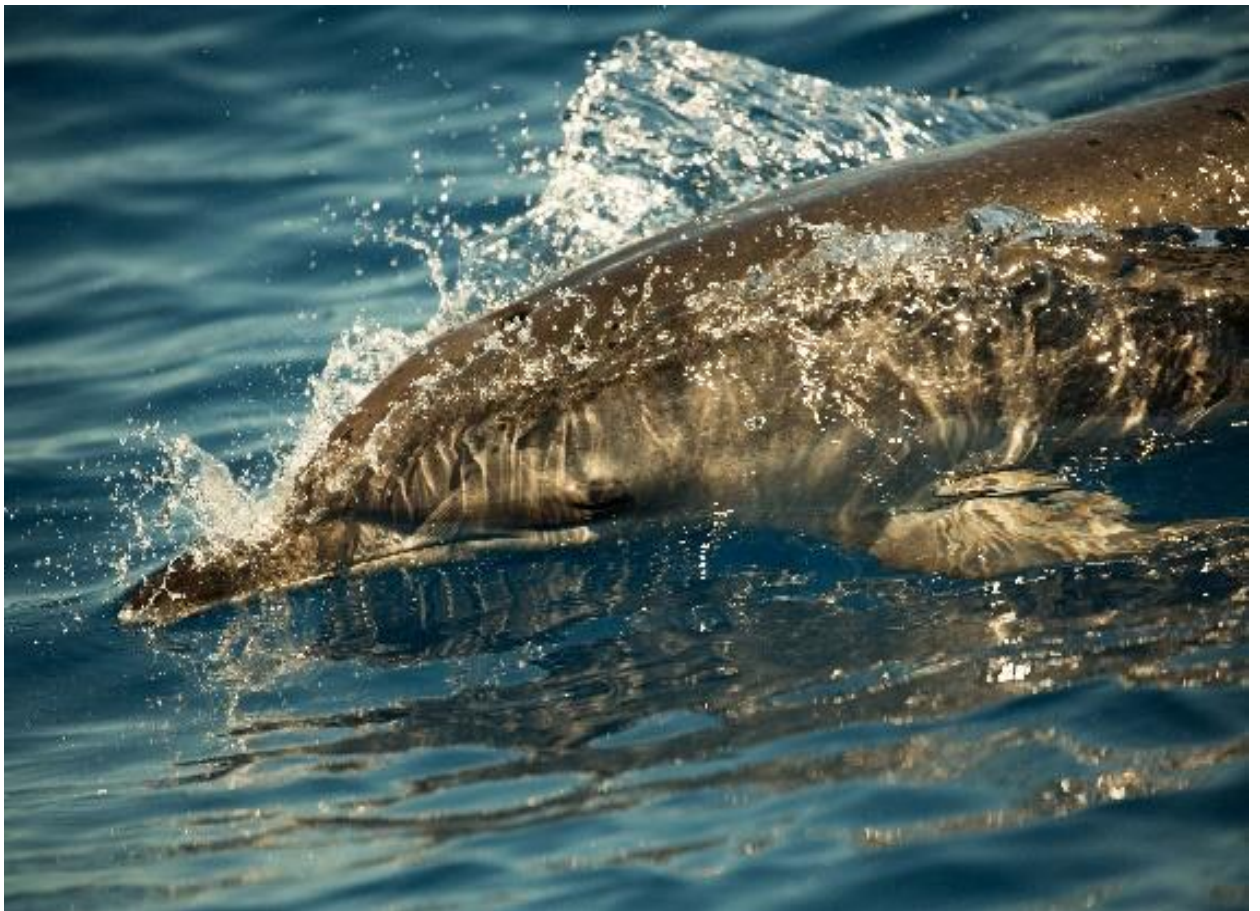
Spotted Dolphin bow-riding the rib