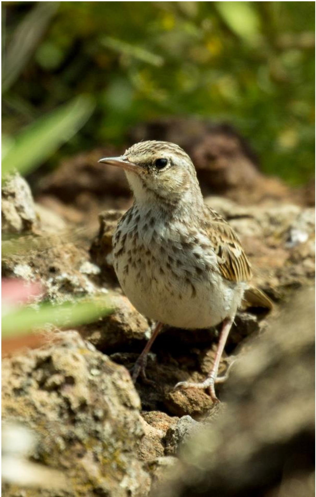
Berthelot's Pipit some of which were quite tame