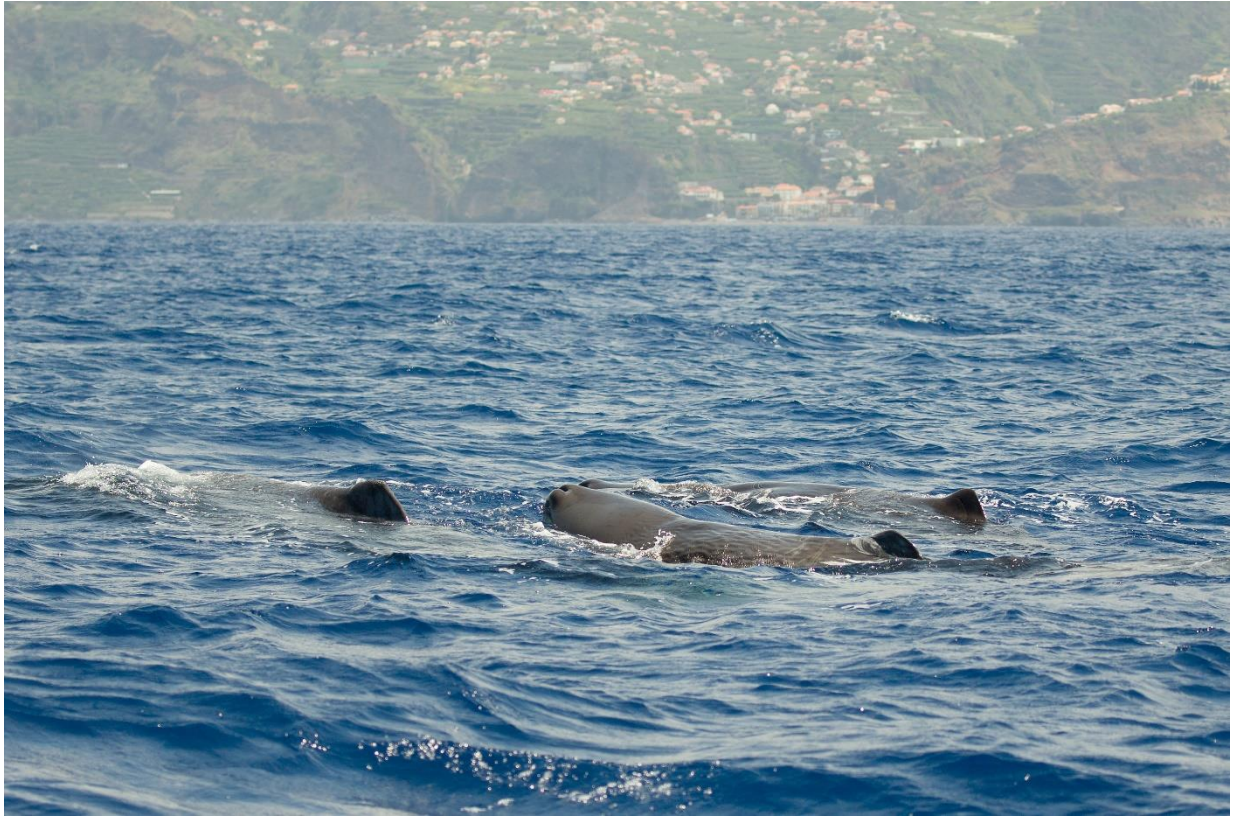
A young Sperm whale flanked on both sides by protective females

The lighthouse at Ponto do Pargo was visited in the afternoon where I walked along the cliff top. Several bird species were seen here including Berthalot's Pipits and Spectacled Warbler.