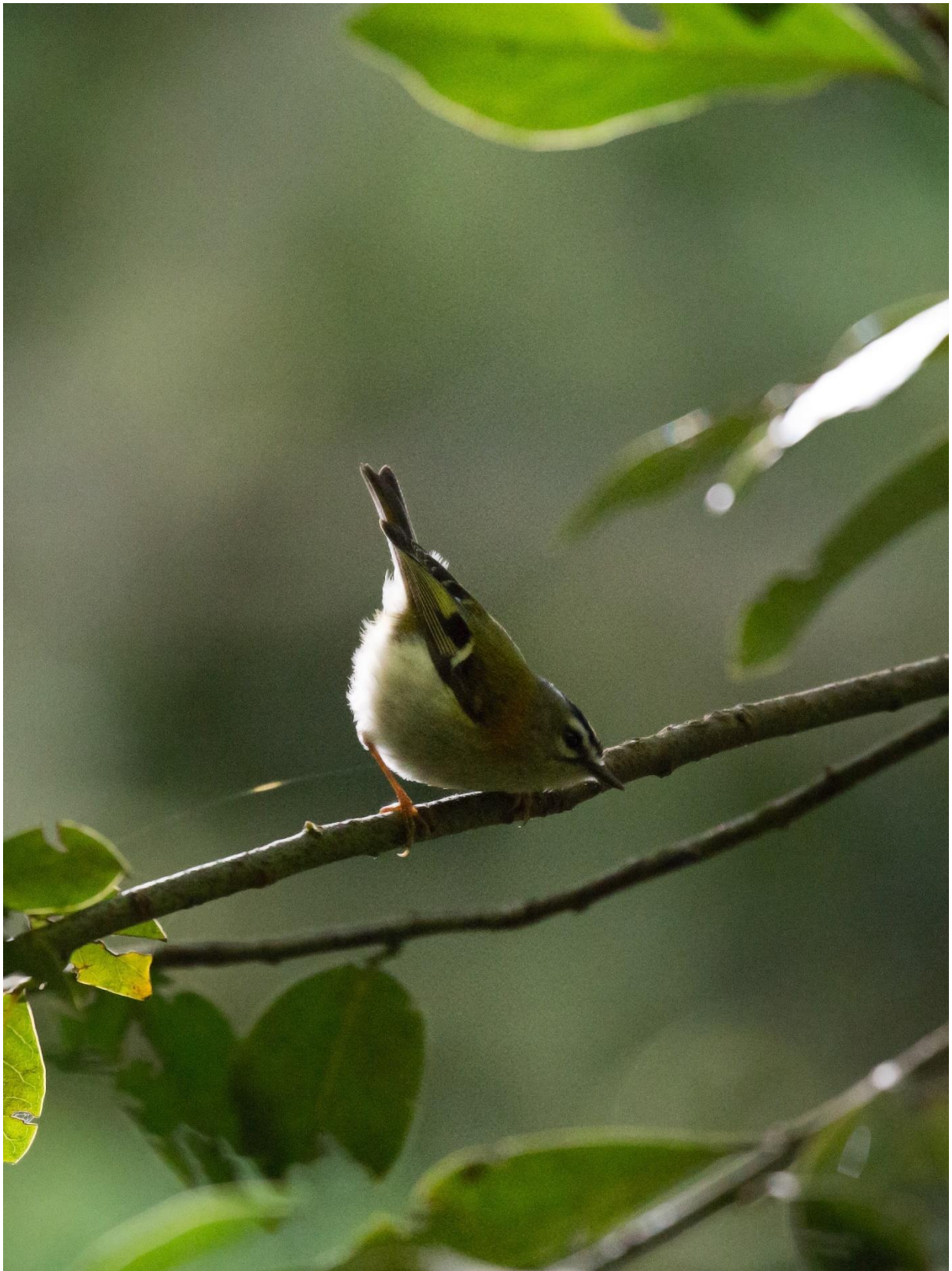
Madeiran Firecrest – a shorter white supercilium is the most distinctive feature to separate from Firecrest but there are other id features.