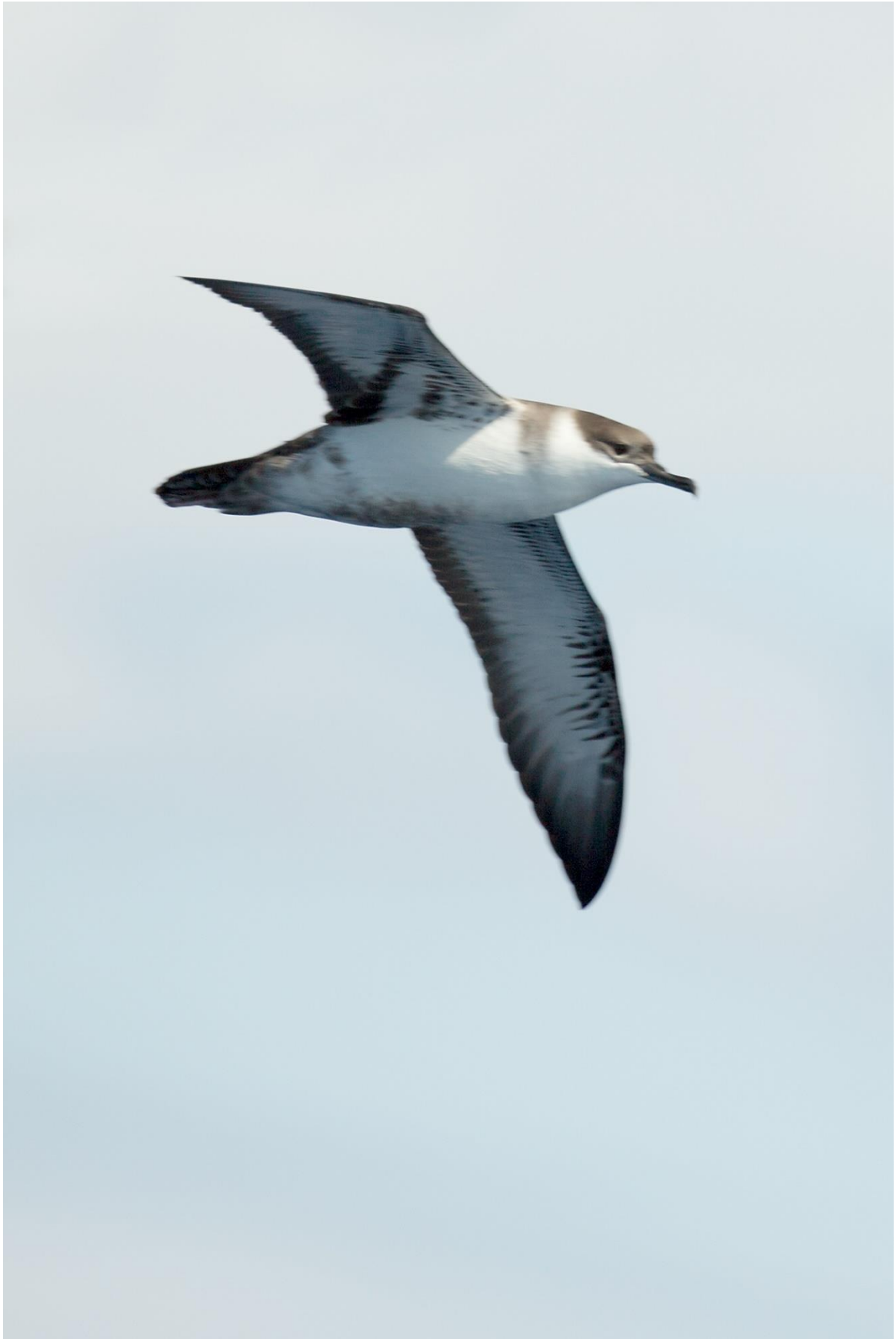
Great Shearwater – just a single bird seen at one of the melees around a fish bait ball.