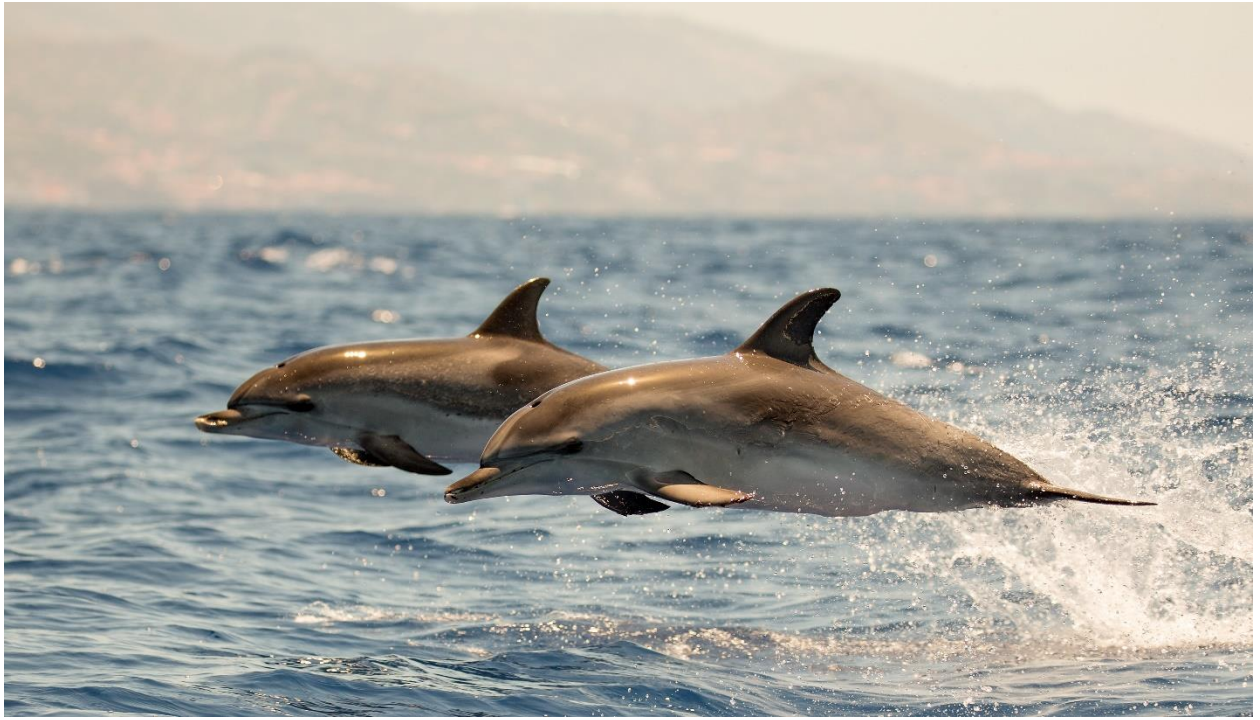
Juvenile Spotted Dolphin breaching – they were without doubt the most entertaining dolphins I've ever come across.