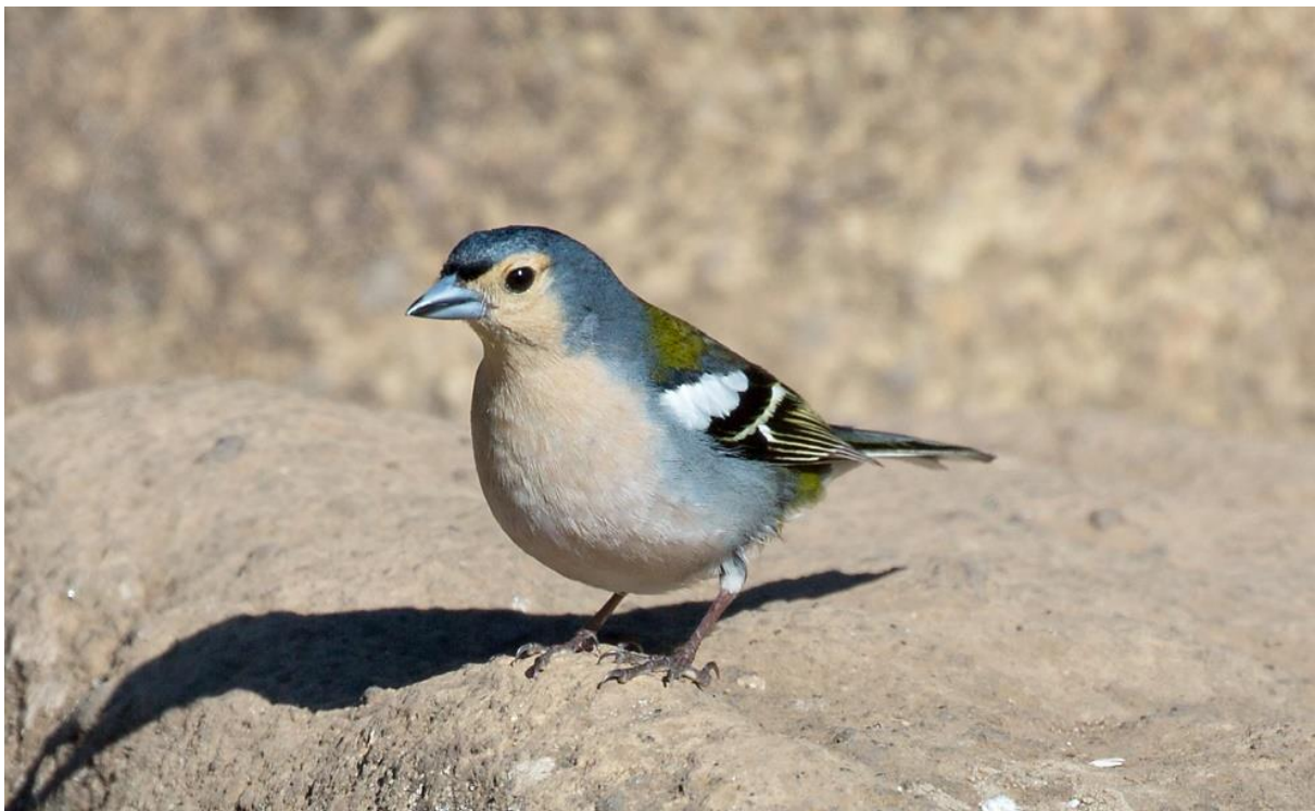
Madeiran Chaffinch - very tame at the view point and easily found.