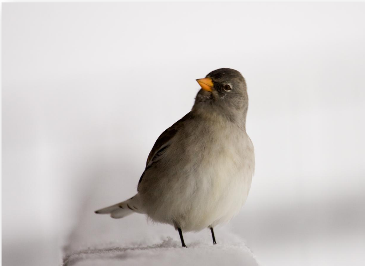
Snowfinch - Stubnerkogel