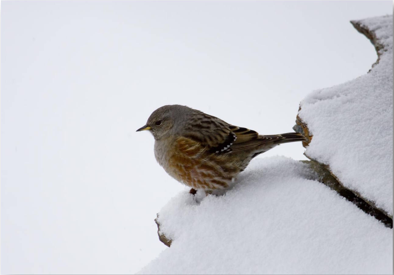
Alpine Accentor - Stubnerkogel