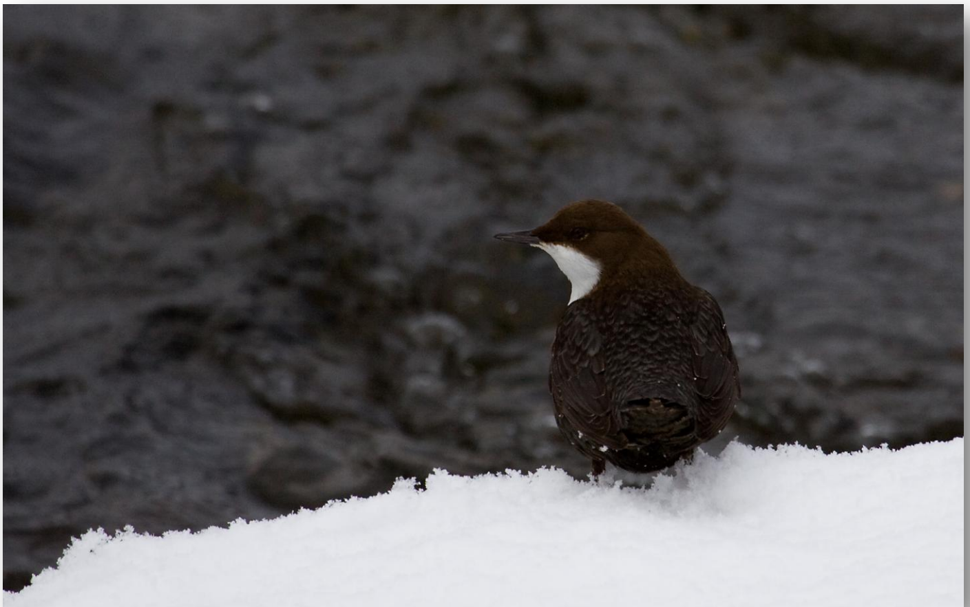
Dipper – Bad Hofgastein