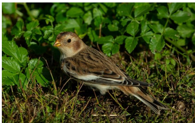
Snow Bunting on the North Norfolk Coast

Sun 8 th Dec 2024 Winter Visitor Day: A day along the coast looking for Winter Visitors – meet in West Runton: £55