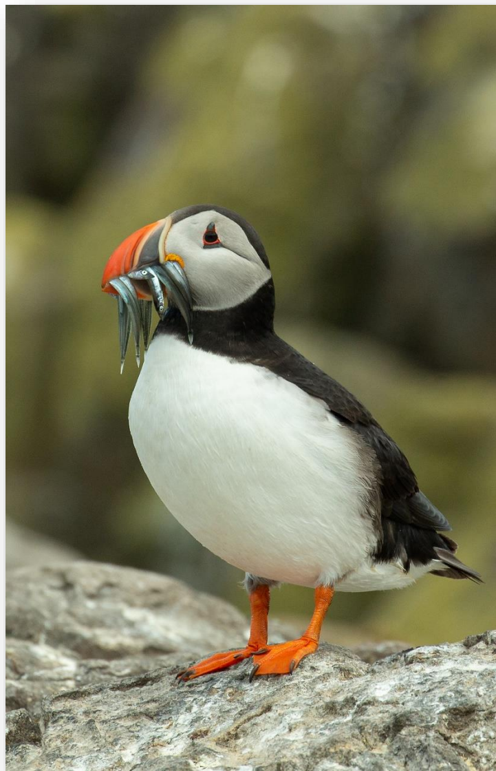
Puffin by Carl Chapman

Shortly after we will make our way back to Norfolk maybe stopping to visit other places along the way.