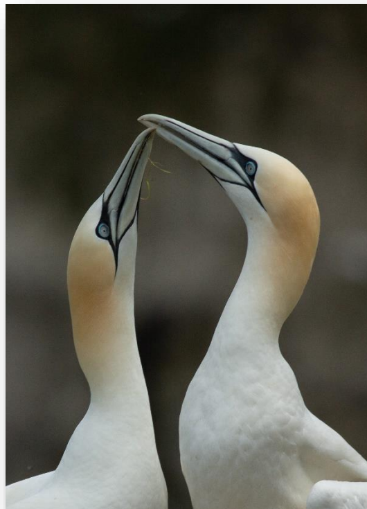
Gannets by Carl Chapman

Day 3 Visit to a Tern Colony and drive back to Norfolk