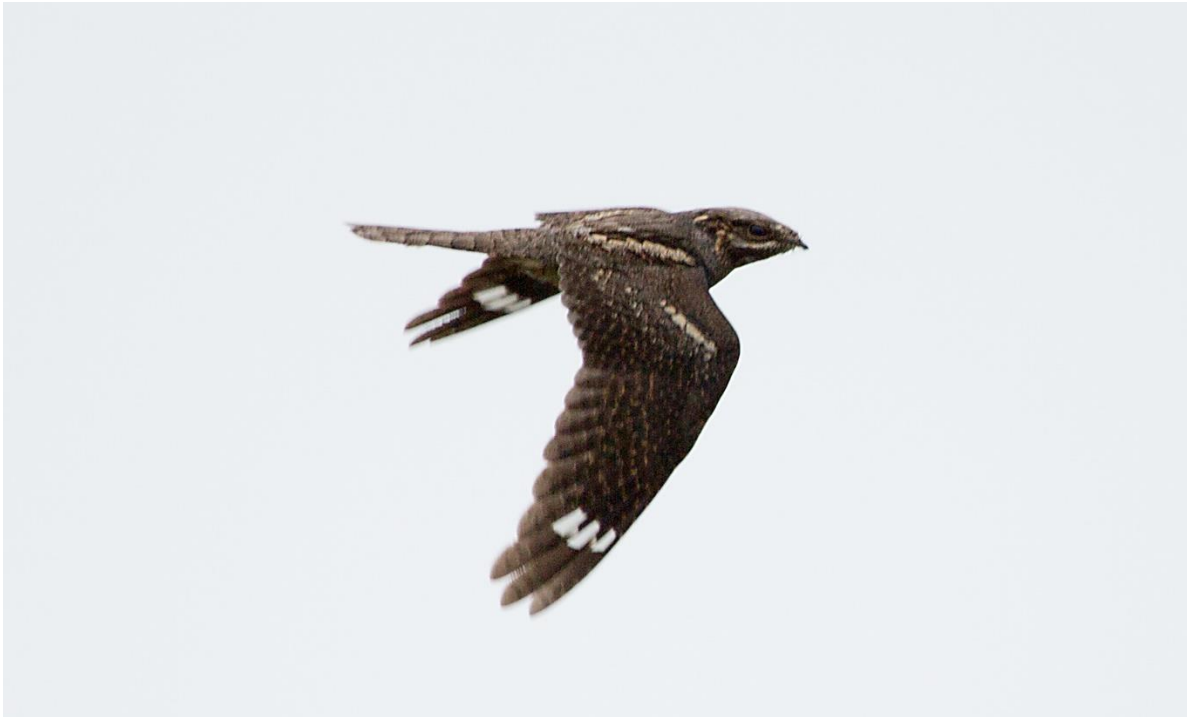
Nightjar – Carl Chapman