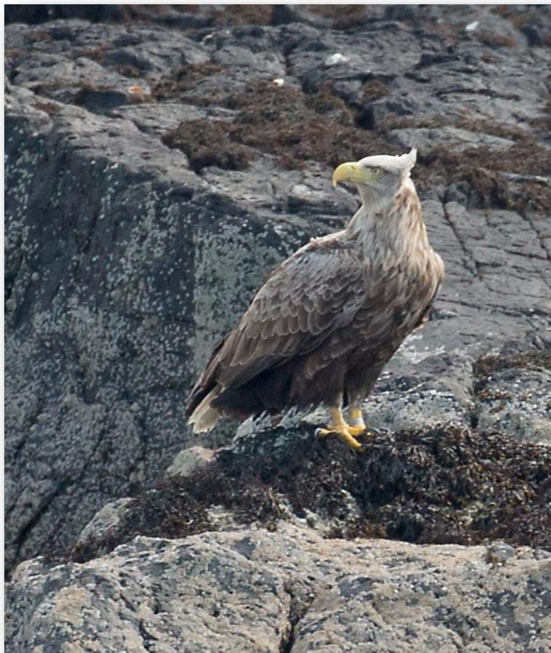
White tailed Eagle by Carl Chapman

We will retire back to our accommodation for dinner but may go out later to see if we can see and hear Nightjars. After a full day we will be ready for a good nights' sleep.