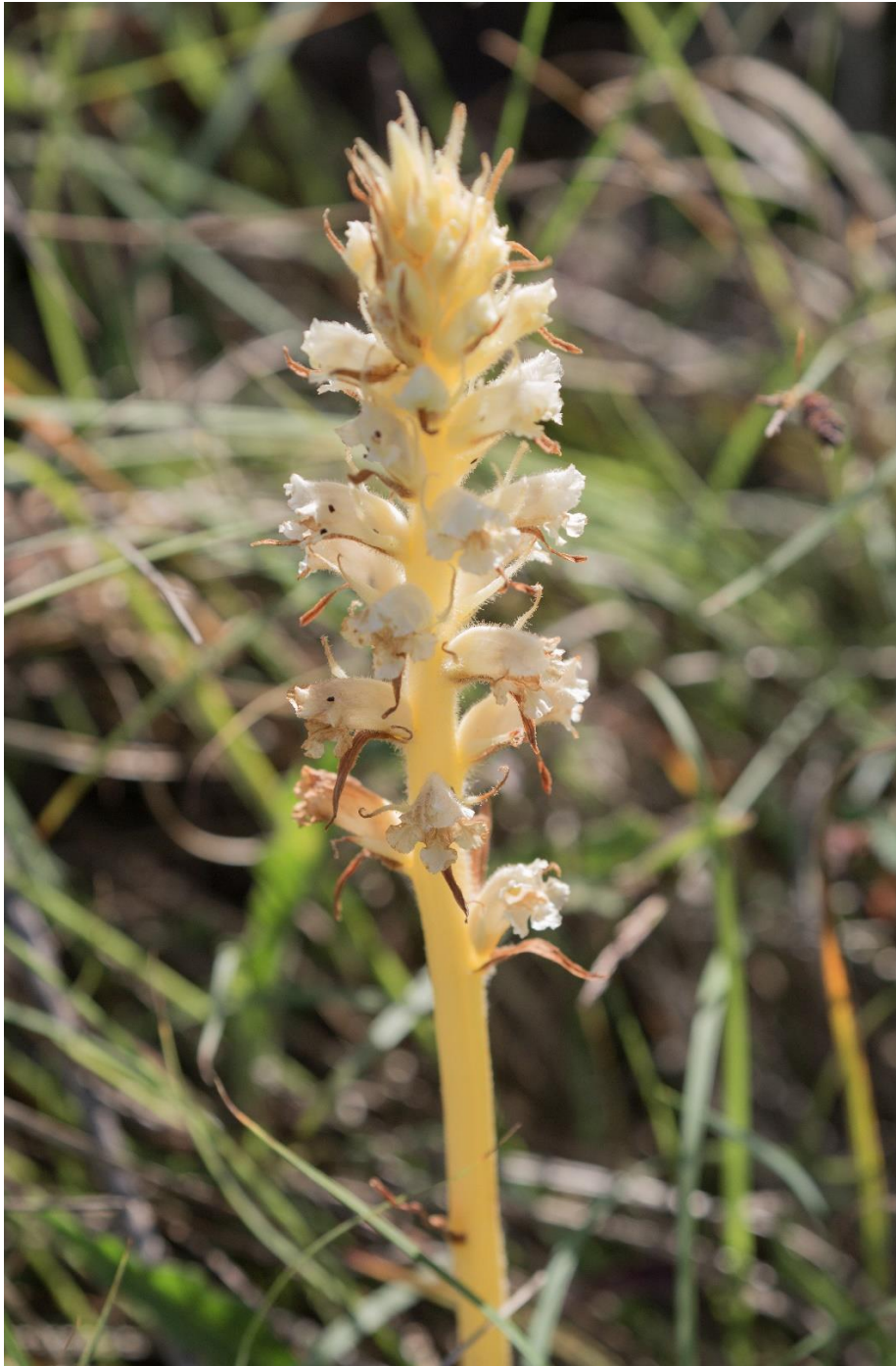
Ox-tongue Broomrape – a rare plant of the form 'lutea'

After a filling breakfast we will head towards Southampton to catch a ferry to the Isles of Wight. We hope to take in a number of species here including the rare Glanville's Fritillary and perhaps Ox-tongue Broomrape including the rare form 'lutea' as we walk along the white chalk cliffs that define the landscape. We will also search for the White tailed Eagles that are now nesting on the island.