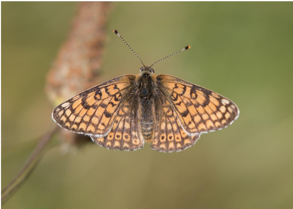
Glanville's Fritillary by Carl Chapman