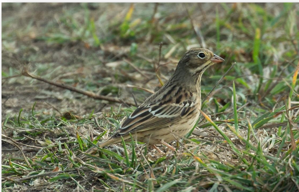
Ortolan Bunting – a regular autumn vagrant on the Isles of Scilly.

Website: www.wildlifetoursandeducation.co.uk