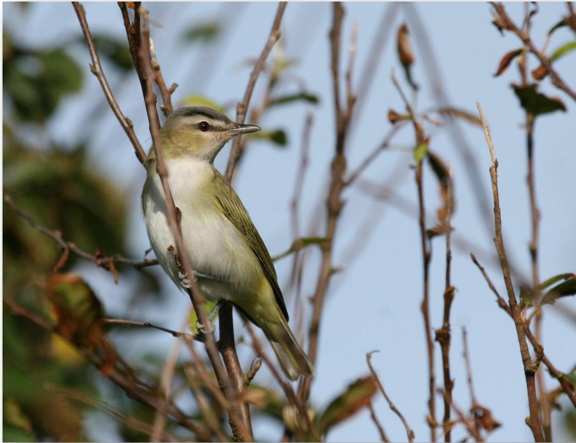
Red eyed Vireo – A not too infrequent Autumn visitor to the Isles of Scilly from the Americas

If this doesn't get your mouth watering nothing will!