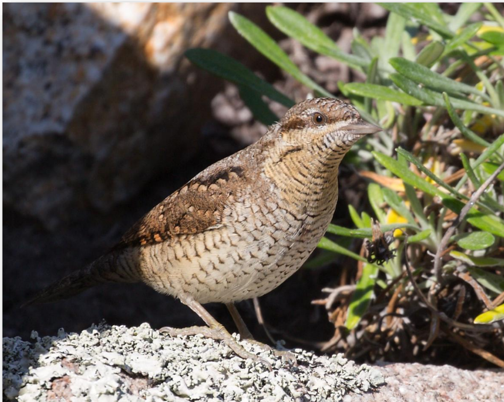
Wryneck quite frequent on Scillies in October