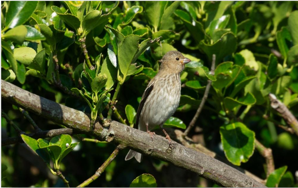
Common Rosefinch we found on St Martins