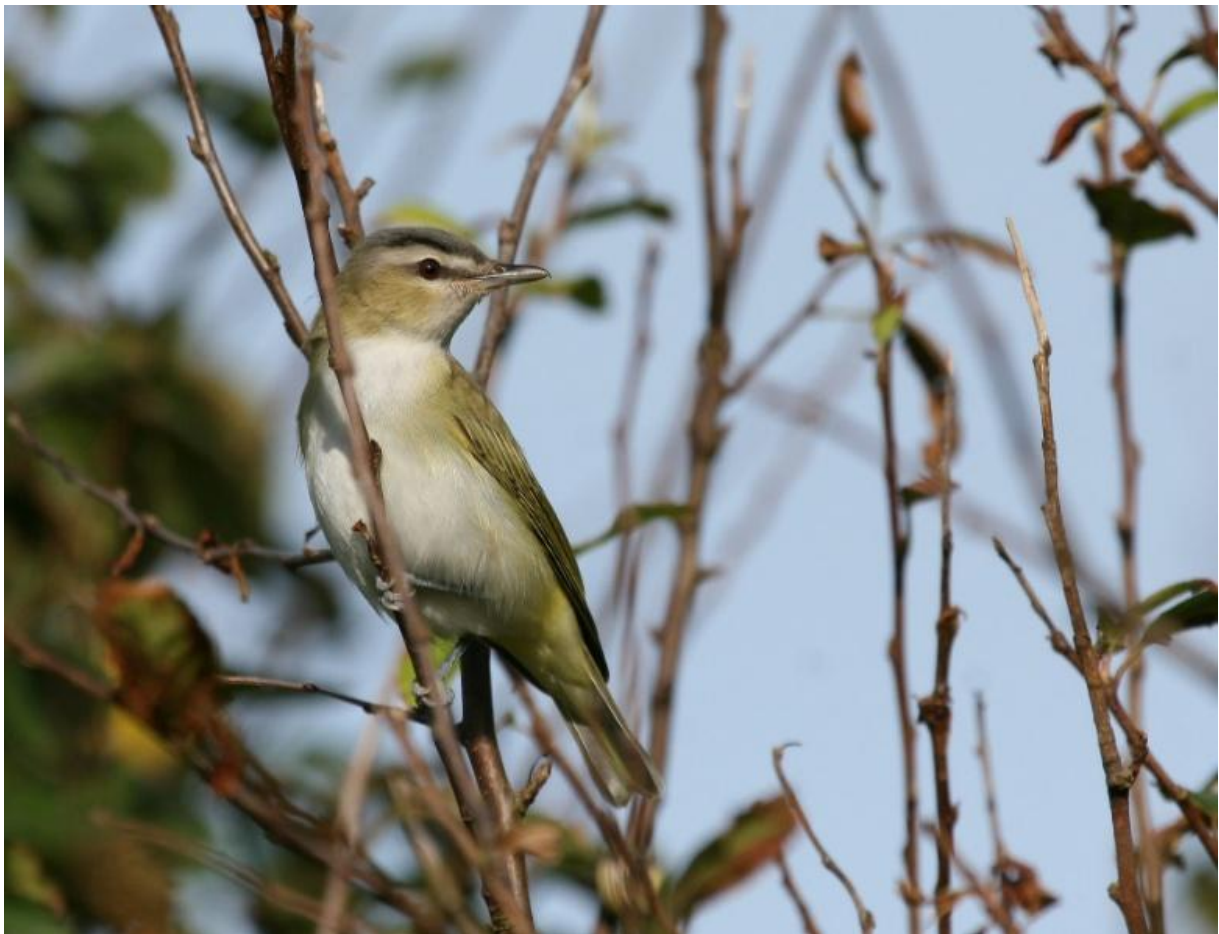
Red eyed Vireo – a regular Autumn visitor to the Isles of Scilly

Bird Watching on the Isles of Scilly 8 days 2 nd to 9 th October 2025 . This is a tour to the beautiful Isles of Scilly searching for rare as well as common migrant birds £2378 TOUR FULL