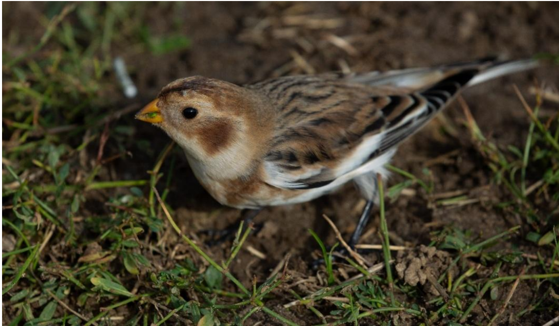
Snow Bunting and Shorelark – regular but decreasing Winter visitors