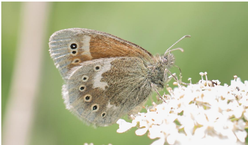
The Large Heath – a difficult butterfly to see

Large Heath Day: Travelling into Lincolnshire to the most Southerly site in the UK for this rare and iconic butterfly. £65