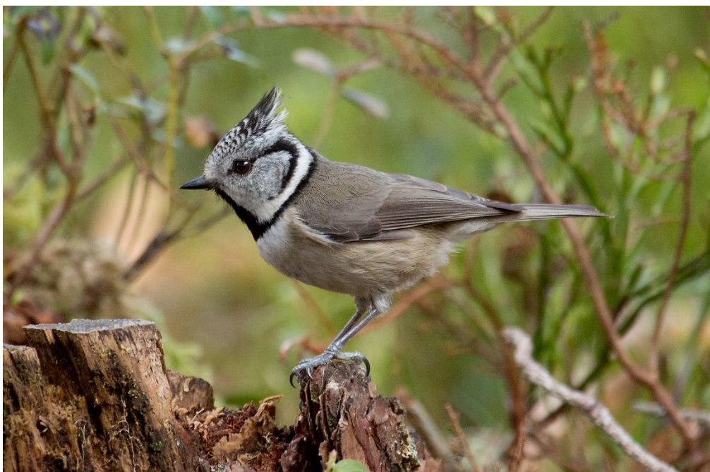
Crested Tit by Carl Chapman

We will have an early morning visit for Capercaillie. There may also be the added benefit of Crested Tit in the surrounding woodlands. Later in the day a visit to the higher Mountain Plateau on Cairngorm may well give us the opportunity to see first of all Black Grouse followed by Red Grouse and Snow Bunting and as we press upward the enigmatic Ptarmigan.