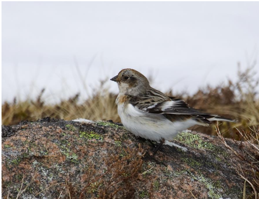
Snow Bunting by Carl Chapman

Website: www.wildlifetoursandeducation.co.uk