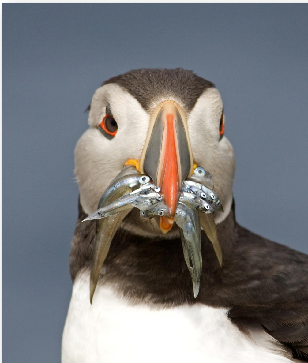
Puffin by Carl Chapman

Shortly after we will make our way back to Norfolk maybe stopping to visit other places along the way.